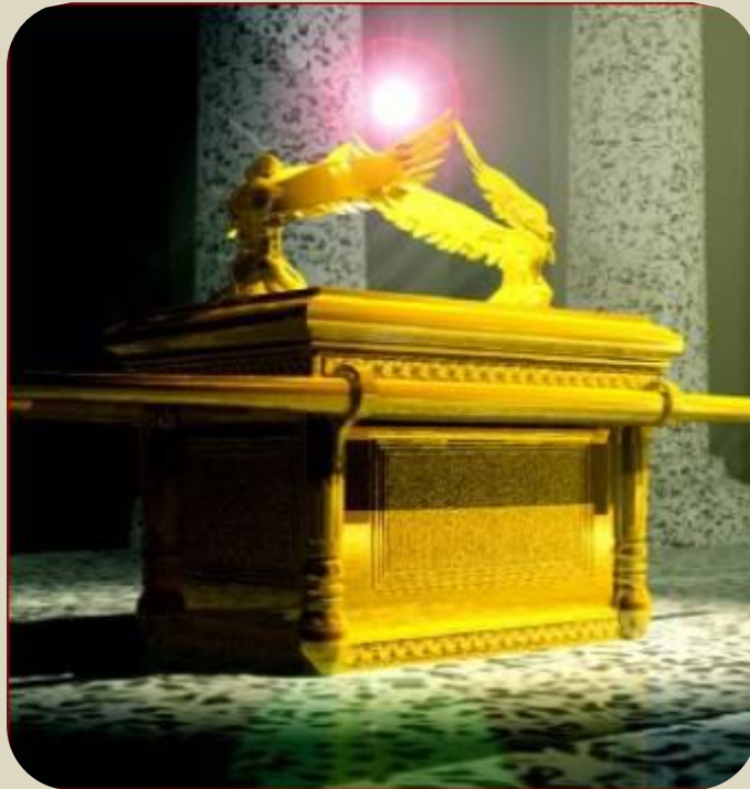
Ark of the Covenant

God detests idolatry. But do His commandments absolutely prohibit the making of statues or images for religious purposes? We know from the Word of God that they do not . In Exodus, God commands that statues and images be made for religious purposes.